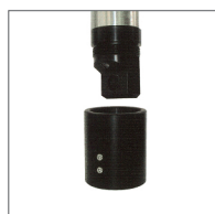
Calibration Board detached

By using secondary Zero Standard, Simple Zero-Calibration Board, Zero-Calibration Water is not necessary. (for the first Zero Standard, Pure Water is used)