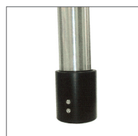
Zero-Calibrated (Calibration Board is set)