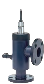
Flow type Detector TRD-120FN+TRD-FH