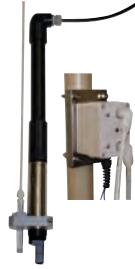
Detector with jet-air washing unit