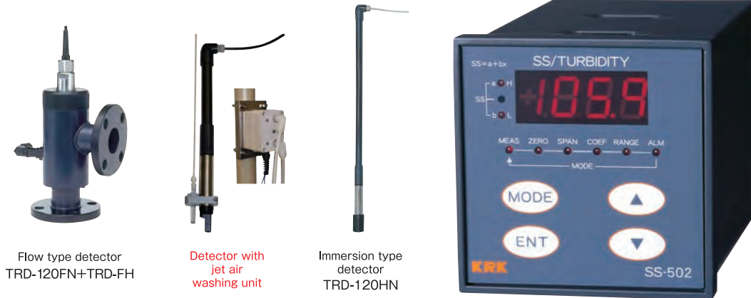
Flow type detector TRD-120FN+TRD-FH

Near-infrared 90° scattered Light measuring System