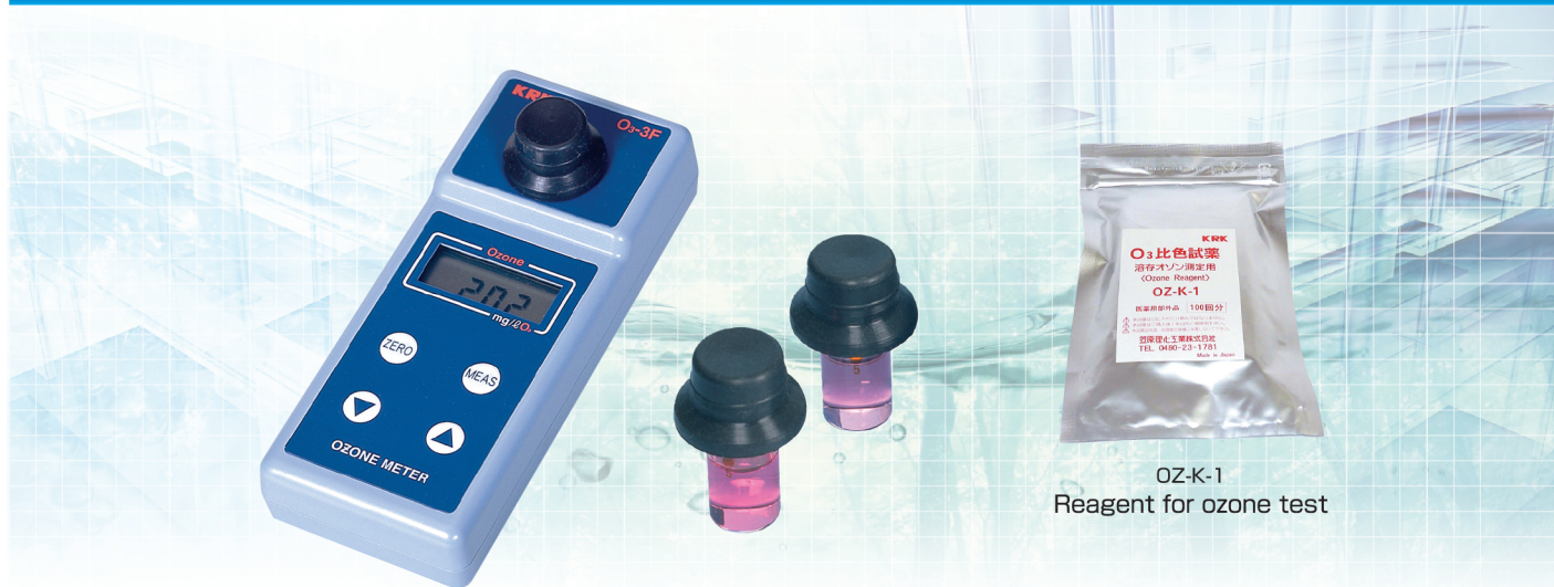
OZ-K-1 Reagent for ozone test