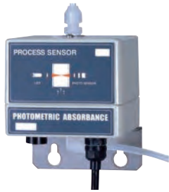
CRD-10F (for normal temperature) Sensor of excellent chemical-resistant

Density Measurement of various kind of Processes Solution.